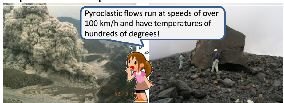
Pyroclastic flow moving down rapidly from a volcano

Take action to protect yourself immediately if you become aware of a volcanic eruption or an Eruption Notice is issued. There is no time to waste.