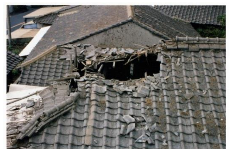
Hole in a tiled roof caused by a ballistic projectile from a volcanic eruption